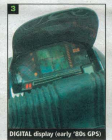
3 DIGITAL display (early '80s GPS)