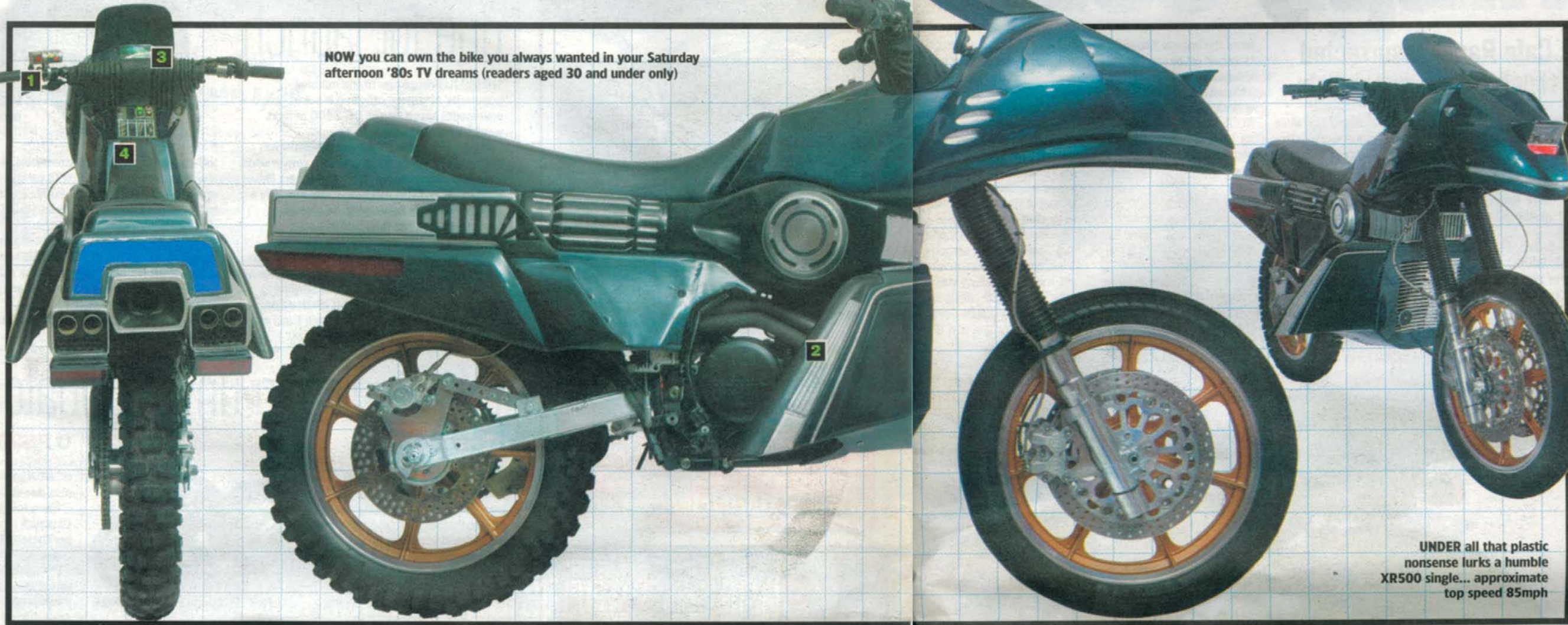
NOW you can own the bike you always wanted in your Saturday afternoon '80s TV dreams (readers aged 30 and under only)

Call Bromham on 07742-526110 to make a bid.