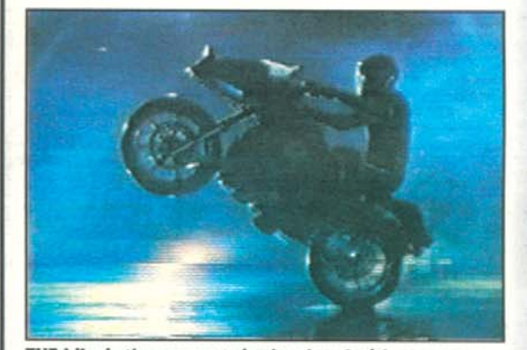
THE bike is the one seen in the show's title sequence