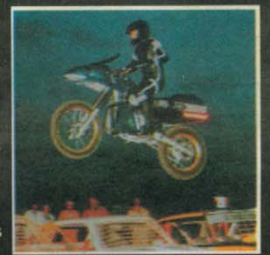
JUMP career helped with TV stunts

His long stunt career has seen him jump 28 cars (170ft) in 1981, 18 double decker buses (208ft) and 20 juggernauts (241ft) in 1986. He broke five world records and is the only motorcycle jumper to get in the Guinness Book of Records twice. And the only bones he has broken are both his little fingers.