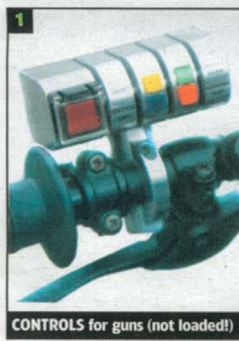
1 CONTROLS for guns (not loaded!)