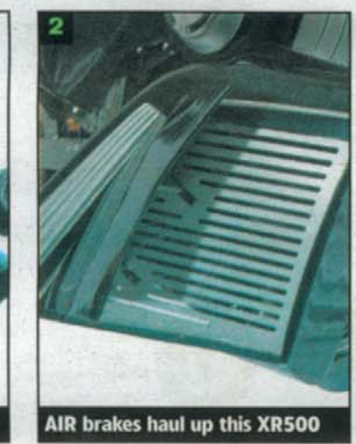
2 AIR brakes haul up this XR500